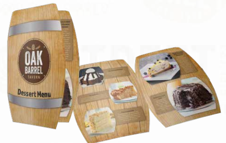
Beer Barrel Folded Menus